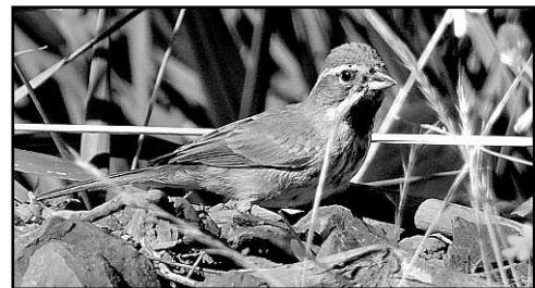
A Black-throated Sparrow stopped briefly at Cabell Marsh, 14 Sep, establishing the first recent fall record for the Corvallis area.